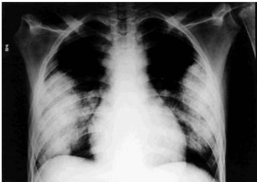
Figure 1 —Chest roentgenogram showing bibasilar infiltrates consistent with pulmonary hemorrhage.

normal. The boy was in good clinical condition 2 months later, but still had slight hypertension. c-ANCAs were absent.